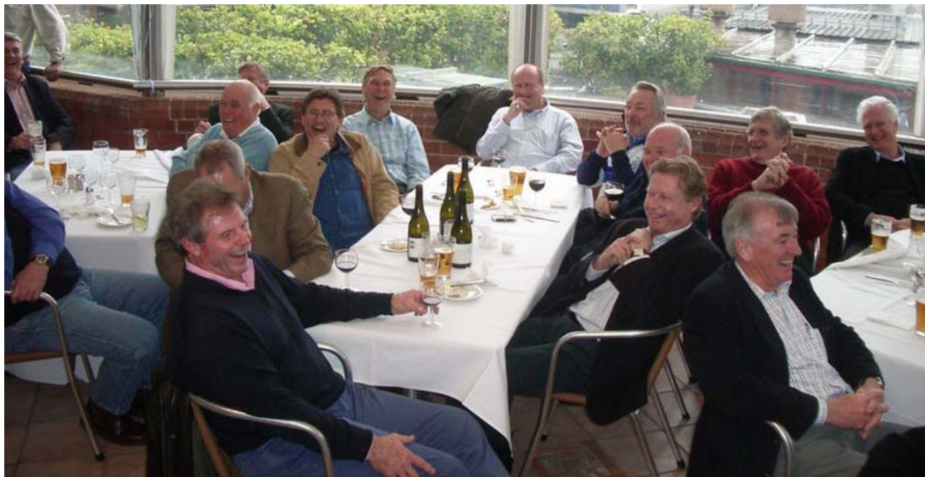
The 1969 "Swig" of Vicarious Members

It has been 40 years, almost to the day, since that inaugural season culminating in 0 - 3 Loss to Whale Beach SLSC. So to celebrate that event the boys of 1969 caught up for a few drinks.